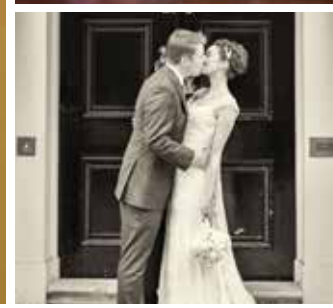
Home House is open every day of the year and we pride ourselves on the imaginative solutions we can create for every season in the calendar.